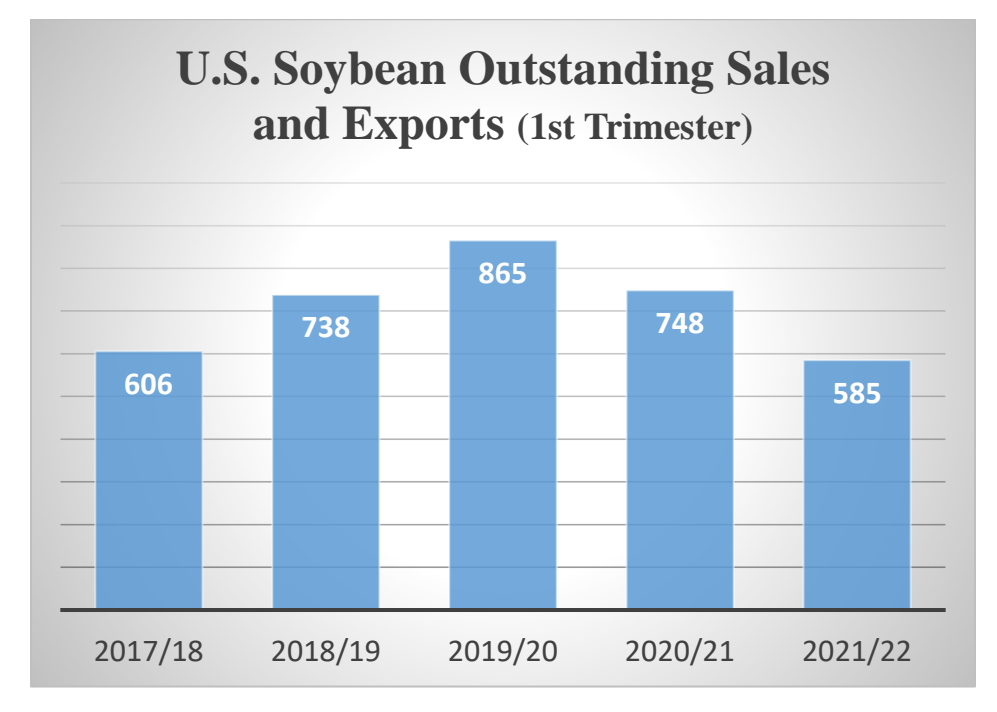
Figure 2: U.S. soybean exports and outstanding sales through first four months of marketing year.